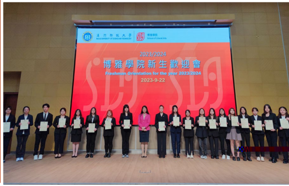
SLA Students Receiving Dean