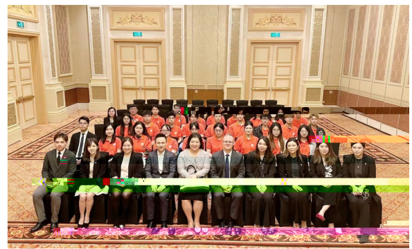
Students Visiting Macau Sheraton