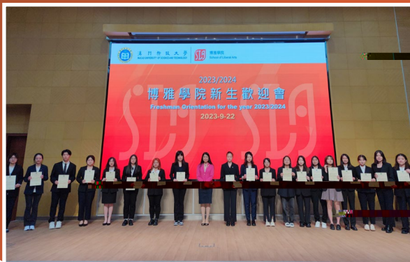
SLA Students Receiving Dean