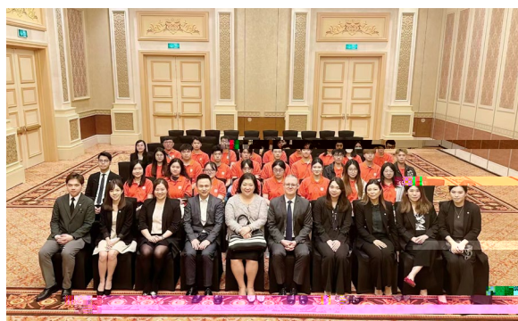
Students Visiting Macau Sheraton