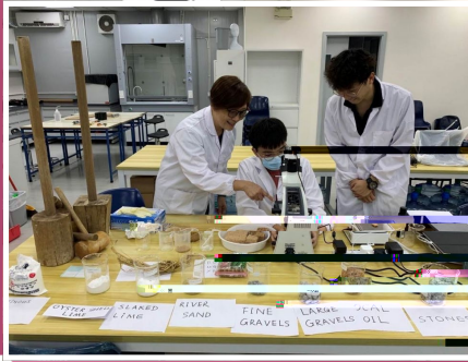
▲ Sample Analysis in Heritage Conservation Laboratory