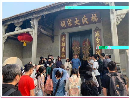
▲ Outdoor Research