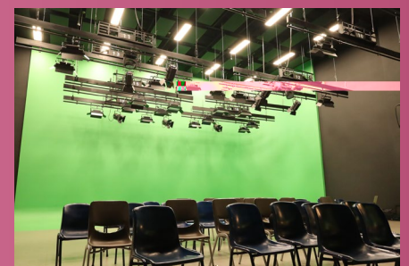
▲ Film Studio