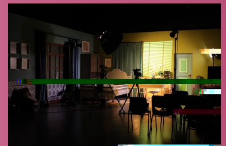
▲ Scenery in the Film Studio

The faculty regularly organizes the "Distinguished Lecture Series in Arts", and the "Art Forum". The faculty annually holds various activities like International Communication Week, Film Exhibition, Graduation Exhibition, and publishes graduation portfolio. In addition, the faculty organizes student teams to participate in various national and international field programs, and also presents Commendation to acknowledge students' efforts in such practical work.