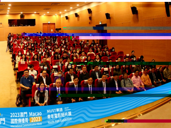
Visual Macau 2023 Macao International Communication Week and MUST Chinese Youth Film Short Film Exhibition